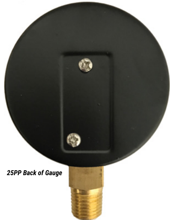
25PP Back of Gauge